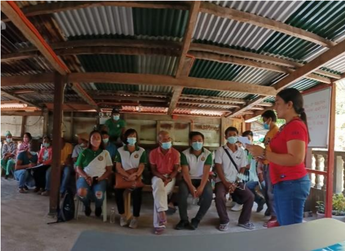
Image 3: MCB Project Staff facilitating the Consultation Meeting with the Balatoc Tribal Council of Elders and Barangay Council on May 19, 2021

Consistent with the Company's commitment to keep the local community regularly informed of project progress and plans moving forward, the in-country team presented project updates particularly relative to the drilling and community development programs (CDP) to the Balatoc Tribal Council of Elders (COE) and Barangay Council (BC).