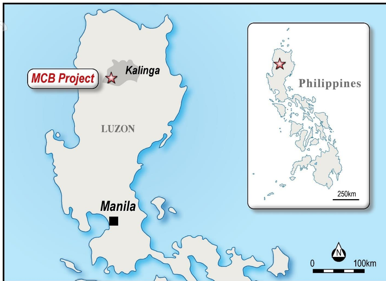
Figure 1: Location of the MCB Project in the province of Kalinga, Northern Luzon, Philippines.

The geological setting for the MCB copper-gold mineralisation is typical of a porphyry copper + gold + moly deposit. The mineralisation and associated alteration exist across the contact between a genetically related intrusive body (tonalite) and the surrounding host rock material. In most cases the surrounding host rock is an older mafic volcanic rock (see Figures 2 and 3).